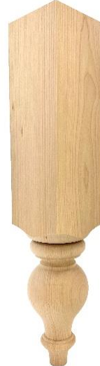
Marseilles Coffee Table Leg CTL03 - 3 ½ x 18