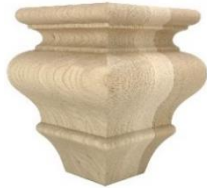
Square Bordeaux Bun Foot SBF107 - 3 7/8 x 4 1/2 SBF108 - 3 3/8 x 4 1/2 SBF109 - 4 1/2 x 4 1/2