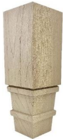
Empress Sofa Leg SSL138 - 3 1/2 x 10