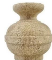
Hatfield Bun Foot

RBF135 - 3 3 / 8 x 3 3 / 4 RBF136 - 4 7 / 8 x 3 3 / 4