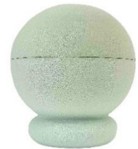
Solomon Ball Finial HDU Outdoor Use FNL16 - 2 15/16 x 3 1/4