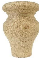
Abilene Bun Foot RBF110 - 3 3/8 x 4 1/2