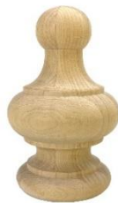
Winton Finial Indoor Use FNL02 - 3 3/4 x 6