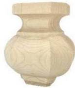
Octagonal Versailles Bun Foot