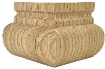
Square Welsh Bun Foot