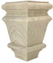
Square Baymont Bun Foot SBF163 - 2 7/8 x 4 1/2 SBF120 - 3 3/8 x 4 1/2 SBF166 - 4 7/8 x 4 1/2