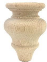
Bordeaux Bun Foot RBF107 - 3 7/8 x 4 1/2 RBF108 - 3 3/8 x 4 1/2 RBF109 - 4 1/2 x 4 1/2