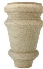
Baymont Bun Foot RBF163 - 2 7/8 x 4 1/2 RBF120 - 3 3/8 x 4 1/2 RBF166 - 4 7/8 x 4 1/2