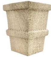
Square Empress Bun Foot SBF139 - 2 7/8 x 4 SBF138 - 3 3/8 x 4