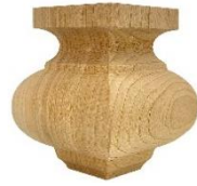
Square Versailles Bun Foot