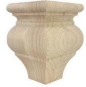
Square Crenshaw Bun Foot SBF113 - 3 3/8 x 4 1/2