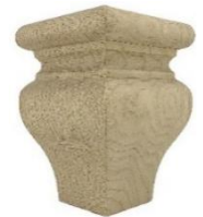
Square Abilene Bun Foot SBF110 - 3 3/8 x 4 1/2