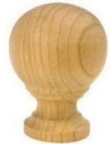
Melrose Ball Finial Indoor Use FNL05 - 2 1/8 x 2 7/8