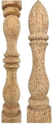
Round Wooden Corner Guard Both Ends & Center Turned CG15 - 1 3/8 x 48