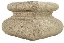
Square Wakefield Bun Foot