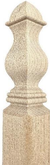
Square on Square Traditional Corner Guard Both Ends Turned CG09 - 1 ½ x 48