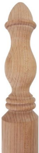
Round Traditional Corner Guard One End Turned CG10 - 1 ¾ x 36 CG11 - 1 ¾ x 42 CG03 - 1 ¾ x 48