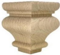
Square Cypress Bun Foot SBF142 - 2 1/2 x 3 SBF141 - 2 7/8 x 3 SBF140 - 3 3/8 x 3