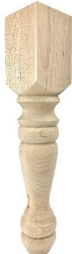
Heirloom Coffee Table Leg CTL28 - 3 x 18 CTL29 - 3 ½ x 18