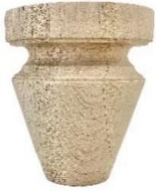
Tall Morrystown Bun Foot RBF132 - 3 7/8 x 4 1/2