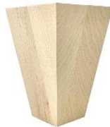
2 Sided Tapered Bun Foot