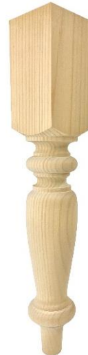
Countryside Coffee Table Leg CTL14 - 3 x 18 CTL06 - 3 ½ x 18