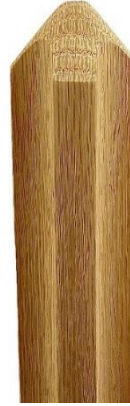
Round Tapered Fluted Corner Guard Both Ends Turned CG18 - 1 3/8 x 48