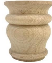
Tavern Bun Foot RBF159 - 2 3/4 x 3 5/8 RBF160 - 3 1/4 x 3 5/8 RBF161 - 3 3/4 x 3 5/8 RBF162 - 4 3/4 x 3 5/8