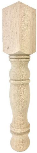
Bedford Coffee Table Leg CTL17 - 2 ½ x 18 CTL18 - 3 x 18 CTL19 - 3 ½ x 18 CTL40 - 4 x 18