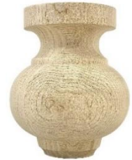
Versailles Bun Foot RBF112 - 3 3/4 x 4 1/2