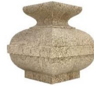
Square Hatfield Bun Foot SBF135 - 3 3/8 x 3 3/4