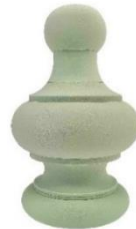
Winton Finial HDU Outdoor Use FNL14 - 3 3/4 x 6