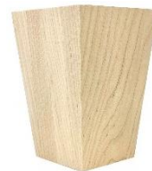
4 Sided Tapered Bun Foot

TBF09 - 3 3/8 x 2 7/8 TBF05 - 3 7/16 x 4 TBF01 - 3 7/16 x 4 1/2 TBF08 - 3 7/16 x 5