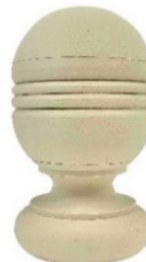
Twisp Beaded Finial HDU Outdoor Use FNL15 - 3 1/16 x 5 1/4