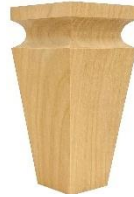
Square Cascadia Bun Foot SBF155 - 2 13/16 x 5 3/4 SBF156 - 3 5/16 x 5 3/4 SBF157 - 3 13/16 x 5 3/4 SBF158 - 4 13/16 x 5 3/4