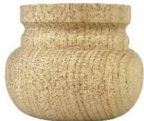
Welsh Bun Foot RBF122 - 3 3/8 x 2 1/2