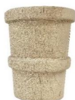
Empress Bun Foot

RBF139 - 2 7 / 8 x 4 RBF138 - 3 3 / 8 x 4