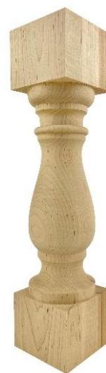
Massive Canterbury End Table Leg ETL02 - 4 ¾ x 21