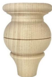
Hudson Bun Foot