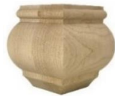
Square Moreland Bun Foot SBF126 - 3 3/8 x 3