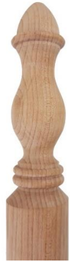
Round Traditional Corner Guard Both Ends Turned CG19 - 1 ¾ x 32 CG02 - 1 ¾ x 36 CG12 - 1 ¾ x 42 CG08 - 1 ¾ x 48