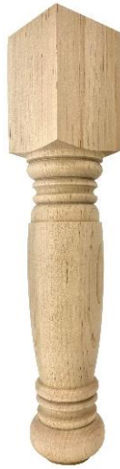
Windsor Coffee Table Leg CTL07 - 3 1/2 x 18