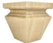
Square Morristown Bun Foot SBF131 - 3 7/8 x 4