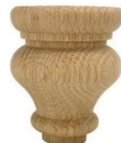
Cypress Bun Foot

RBF142 - 2 1 / 2 x 3 RBF141 - 2 7 / 8 x 3 RBF140 - 3 3 / 8 x 3