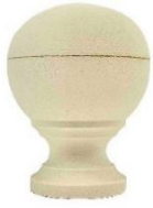
Melrose Ball Finial HDU Outdoor Use FNL17 - 2 1/8 x 2 7/8