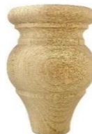
Crenshaw Bun Foot