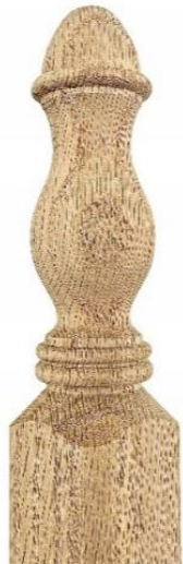
Round on Square Traditional Corner Guard Both Ends Turned CG06 - 1 ½ x 48