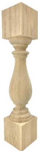
French Coffee Table Leg CTL04 - 3 ½ x 18 CTL05 - 4 ¾ x 18