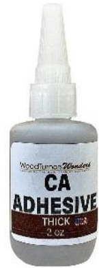
2 oz Thick Adhesive ADH-1