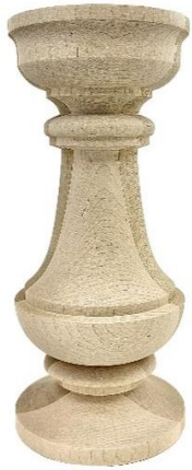
Traditional Express Coffee Table Leg CTL20 - 4 7/8 x 10