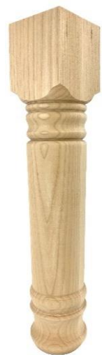
Farmhouse Coffee Table Leg CTL10 - 2 ½ x 18 CTL09 - 3 x 18 CTL13 - 3 ½ x 18