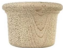
Woodhouse Bun Foot RBF151 - 2 7/8 x 2 5/8 RBF152 - 3 3/8 x 2 5/8 RBF153 - 3 7/8 x 2 5/8 RBF154 - 4 13/16 x 2 5/8