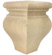
Square Densmore Bun Foot SBF164 - 2 3/4 x 3 3/8