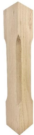
Modern Square Celoron Bench Table Leg BTL09 - 3 ½ x 18