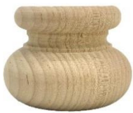
Wakefield Bun Foot RBF116 - 3 3/8 x 2 1/2 RBF117 - 4 1/2 x 2 1/2