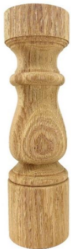
Lyboulte Pedestal Bench Table Leg PD01 - 4 ¾ x 16 ¾