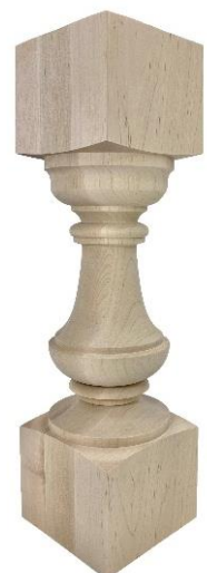
Traditional Express Coffee Table Leg CTL23 - 5 x 18