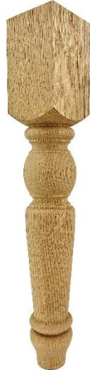
Cheshire Coffee Table Leg CTL37 - 3 x 18 CTL38 - 3 ½ x 18 CTL39 - 4 x 18