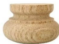
Wyndfield Bun Foot RBF114 - 3 3/8 x 2 RBF115 - 4 1/2 x 2