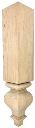
Square Marseilles Coffee Table Leg SCTL03 - 3 ½ x 18