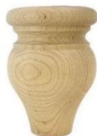
Densmore Bun Foot