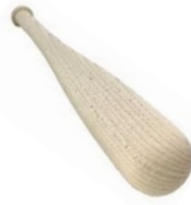
Mini Bat MB1 - 1 \frac{7}{16} x 11