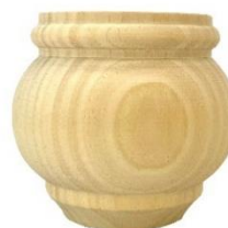
Moreland Bun Foot