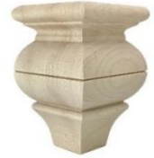
Square Hudson Bun Foot SBF125 - 3 3/8 x 5