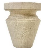
Morristown Bun Foot