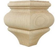
Square Vista Bun Foot

SBF151 - 2 7/8 x 2 5/8 SBF152 - 3 3/8 x 2 5/8 SBF153 - 3 7/8 x 2 5/8 SBF154 - 4 13/16 x 2 5/8