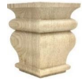
Square Tavern Bun Foot SBF159 - 2 3/4 x 3 5/8 SBF160 - 3 1/4 x 3 5/8 SBF161 - 3 3/4 x 3 5/8 SBF162 - 4 3/4 x 3 5/8