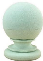
Kline Ball Finial HDU Outdoor Use FNL12 - 3 3/4 x 5 1/2 FNL09 - 4 1/16 x 5 1/2 FNL10 - 4 7/8 x 7 FNL13 - 5 7/8 x 8 1/4