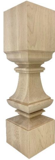
Square Traditional Express Coffee Table Leg CTL01 - 5 x 18