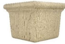
Square Woodhouse Bun Foot

SBF151 - 2 7/8 x 2 5/8 SBF152 - 3 3/8 x 2 5/8 SBF153 - 3 7/8 x 2 5/8 SBF154 - 4 13/16 x 2 5/8