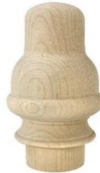
Acorn Finial Indoor Use FNL03 - 2 3/4 x 4 9/16