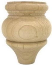
Vista Bun Foot RBF134 - 3 3/8 x 4