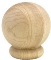
Solomon Ball Finial Indoor Use FNL07 - 2 15/16 x 3 1/4