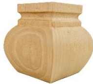
Square Tall Welsh Bun Foot