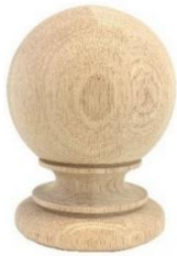
Kline Ball Finial Indoor Use FNL11 - 3 3/4 x 5 1/2 FNL01 - 4 1/16 x 5 1/2 FNL06 - 4 7/8 x 7 FNL08 - 5 7/8 x 8 1/4