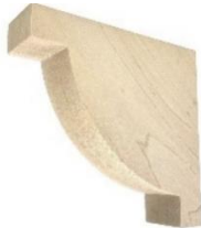
Traditional Wooden Bracket Corbel CRB03 - 1 \frac{1}{2} x 6 x 6