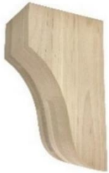
Traditional Corner Bracket Corbel CRB02 - 5 \frac{15}{16} x 4 x 9 \frac{3}{8}