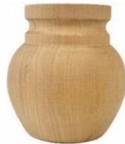
Tall Welsh Bun Foot RBF124 - 3 3/8 x 3 1/2