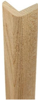
3/8" Reveal Corner Guard CG17 - 1 1/2 x 48