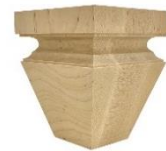
Square Tall Morristown Bun Foot SBF132 - 3 7/8 x 4 1/2