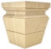
Catalina Tapered Bun Foot

TBF03 - 2 5/8 x 4 TBF04 - 3 3/8 x 4 TBF07 - 3 3/8 x 4 1/2 TBF06 - 3 3/8 x 5