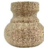
Squat Welsh Bun Foot RBF137 - 2 x 2